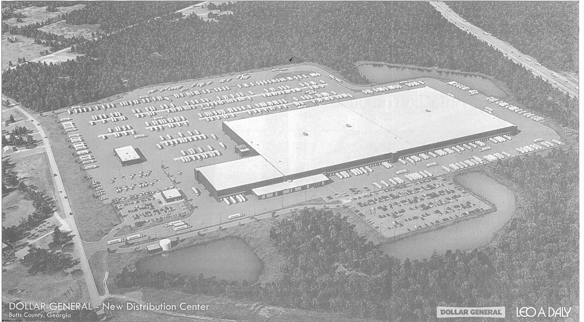
DOLLAR GENERAL - New Distribution Center Bufts County, Georgia